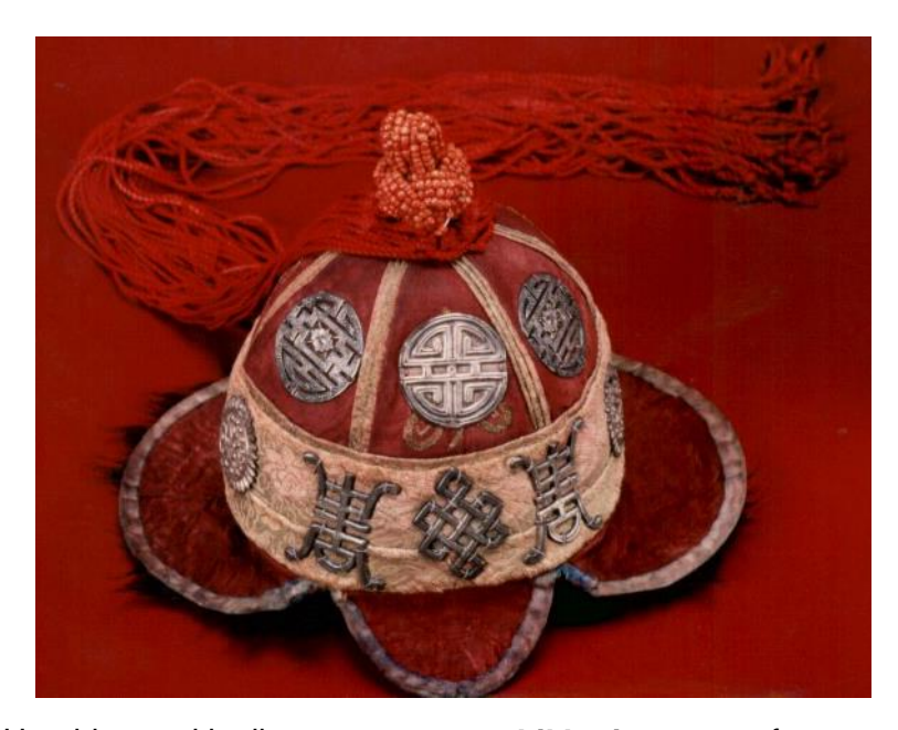
Photo 7 Headdress with silvery ornaments chikhtei toortsog for unmarried girl.

Relatives need gifts to the bride during a bachelorette party - chigee uuh. Another part of the dowry that is necessarily included curtains - beriin khushig, by which dissociated a corner of the yurt, where there was a bed for the newlyweds.