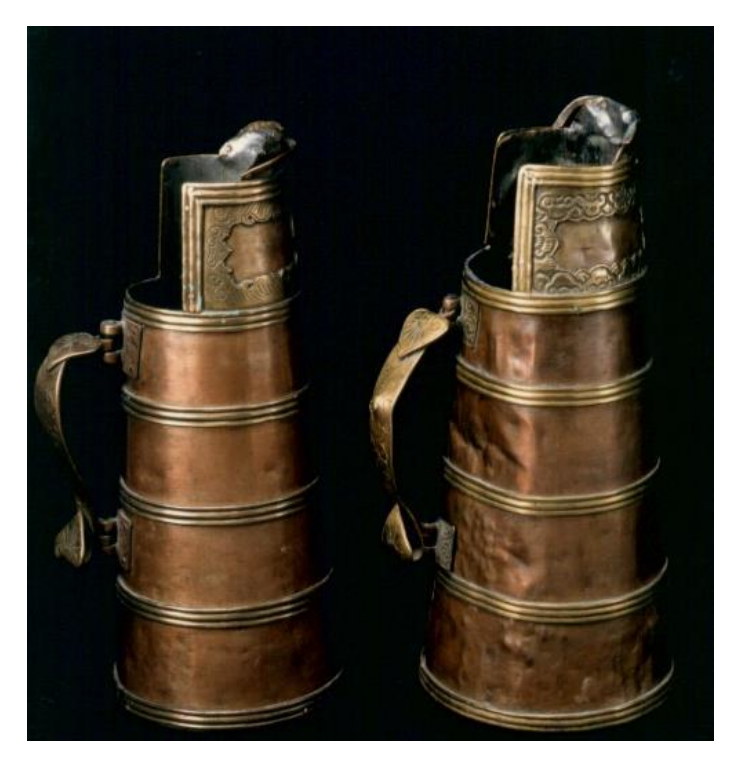
Photo4. Wooden kettle dombo for milk tea

The wooden skeleton of the yurt was covered as follows. On top of the wooden part of the roof stretched white cloth -dotuur burees, lower and upper ends of the ribbons which were attached to the wall to the upper grille and the wooden circle, then placing the upper feltspread. Side walls of the lattice are also closed with felt veils -tuurga and covered the outer upper and outer lower belts of hairy ropes-gaduur goshlon. In addition, each tent had felt tire-urh for the upper range of the smoke tube. It was a piece of felt hexagonal shape, to each his corner sewn long rope from horsehair, five of which are stretched to the wall and ceiling coverings and felt tied to the outer side belts. Rope is sewn into the front corner, which is used for closesure or opening of the top cover holes. Disassemble of the yurt is done as in the reverse order.