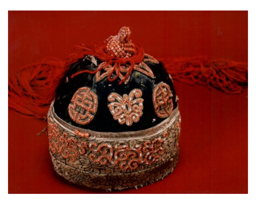
Photo 6. Headdress with coral ornaments shurtei toortsog for unmarried girls