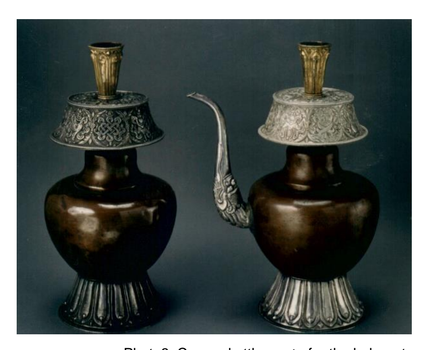
Photo3. Copper kettles guts for the holy water.

a single one. Lateral wall felt consisted of several pieces. Normal size of ger had from 6 to 9 pieces of lateral wall felts. They repeated the form of wall trellises and fastened to each other by knots. Felt covering which clothes the top wooden circle-hole of the yurt (urh) designed to protect against weather and regulation of light and temperature inside the yurt. In addition, a yurt Altaic Uriankhians used for its stability and a lot of hair ropes of knots - oosor, goshlon etc. Yurt was also with the pressure belts attached to stakes driven into the ground. Such clamping belts were especially comfortable in summerautumn period, when the Mongolian Altai has had frequent strong storms and winds. Insolation, aeration and lighting within the tent are carried out through the upper smoke hole.