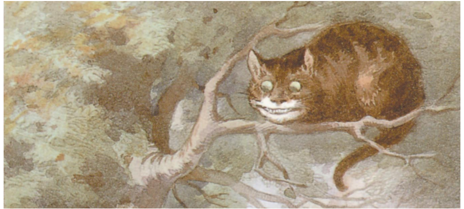
Here and not here: the Cheshire cat may have been the first observation of macroscopic superposition.

Finally, the famous Einstein–Podolsky–Rosen paper of 1935 introduced the idea of pairs of particles strongly correlated over large distances. Einstein had thought that these correlations would be a last-ditch stand of classical realism, because they hint at a possible classical model. But his hope to explain them using hidden properties of the individual systems was shown by John Bell in 1964 to lead to predictions that are in conflict with quantum mechanics. In fact, Schrödinger had realized in 1935 that such correlated systems are extremely non-classical. He coined the term ‘entanglement’ for these correlations and he called them “the essential characteristic” of quantum mechanics.