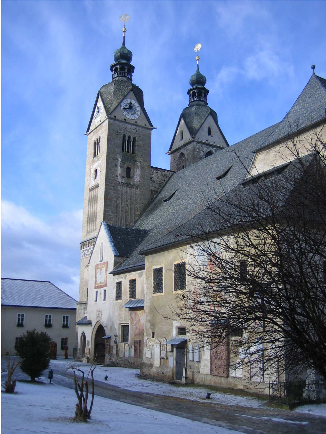
Maria Saal (Gospa Sveta)